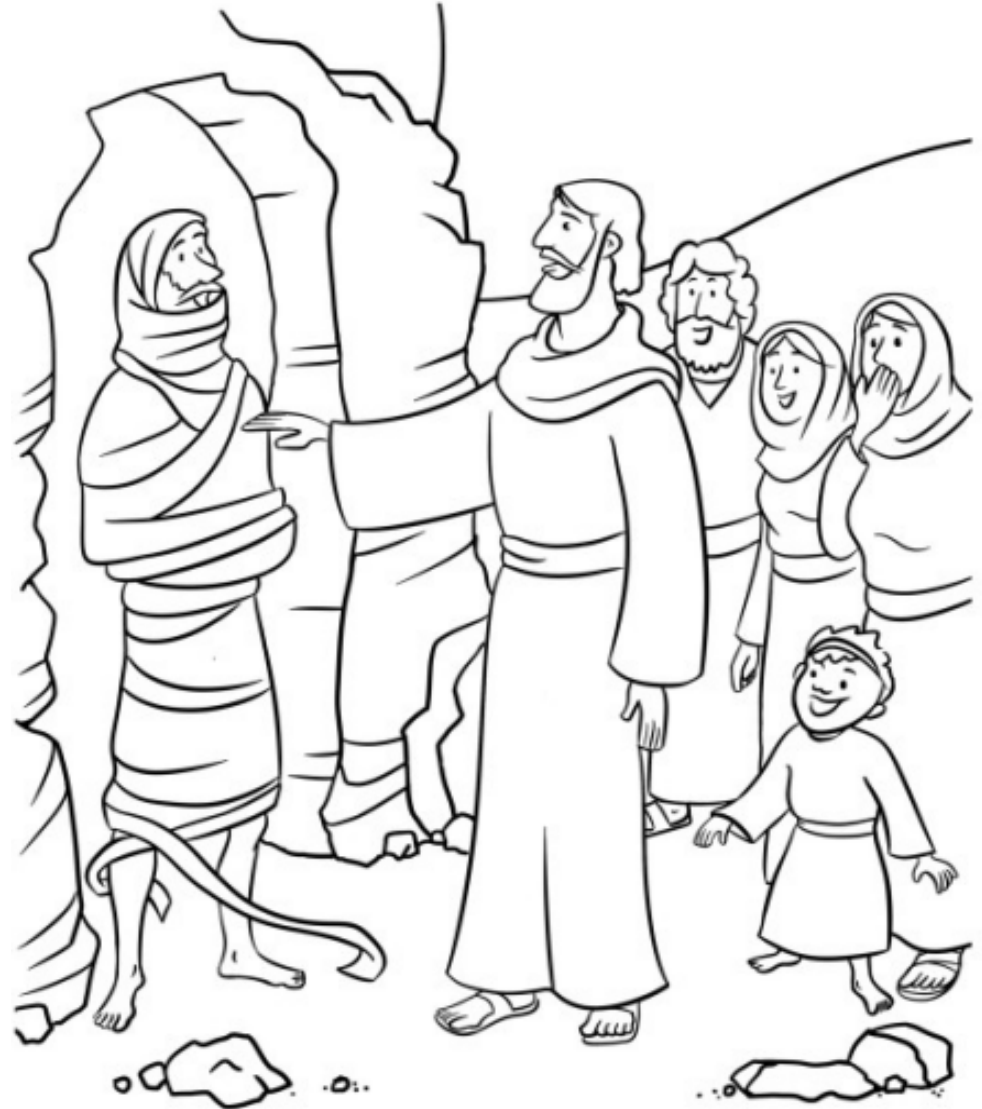
Jesus Raises Lazarus John 11:38-44