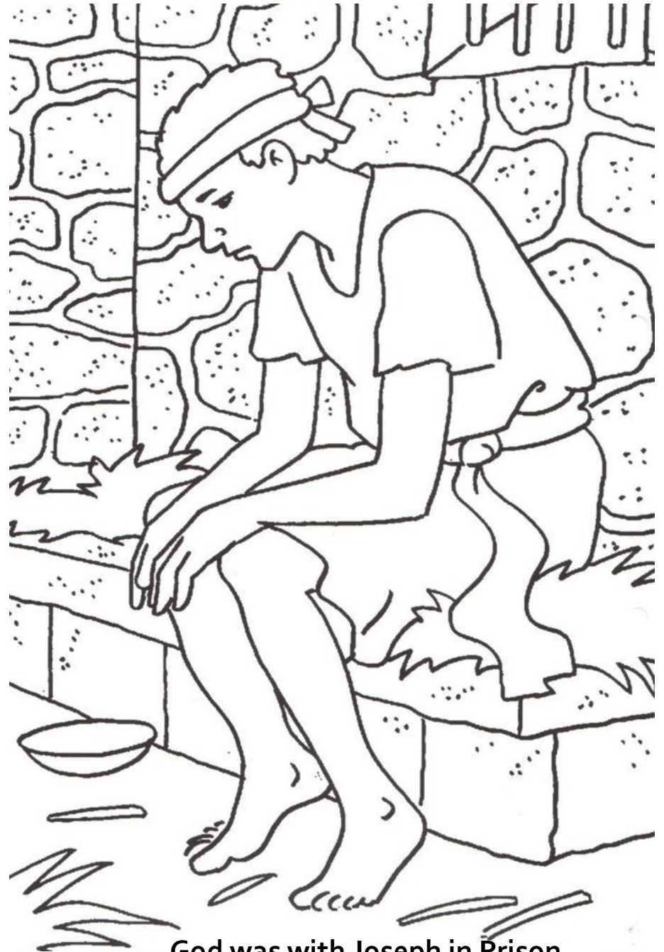
God was with Joseph in Prison